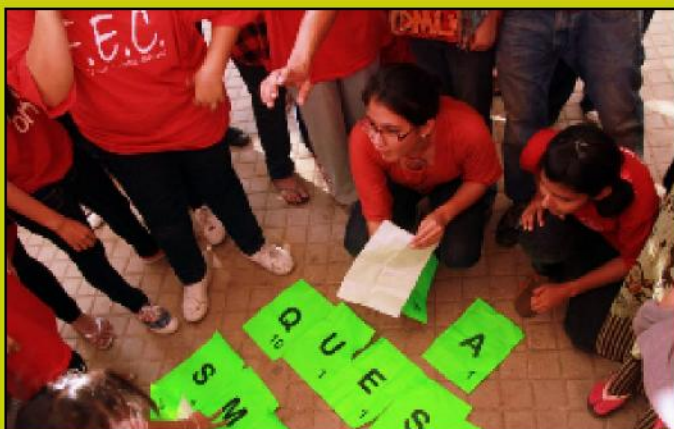
top to bottom: 89 questions after watching Khamosh Pani , the Azadi Initiative on 14th August, Volunteer Roving Photographers at Founders Day 2011 and Sports Day Scrabble Challenge.

for more pics please visit www.ivsalumni.com/foundationyear